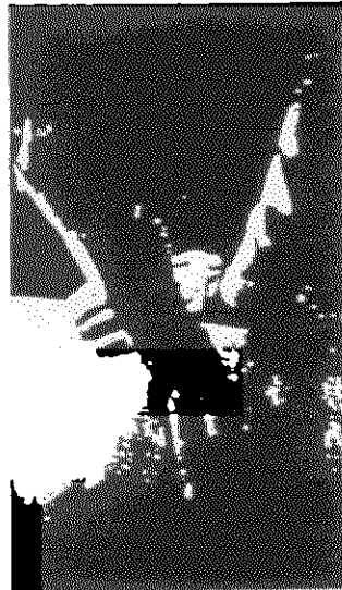
A recent survey gave high marks to chiropractors.

Participants in the survey saw a total of 422 chiropractors and 429 orthopedists (as well as many other kinds of practitioners). Their problems included chronic lower-back pain, ruptured disks,